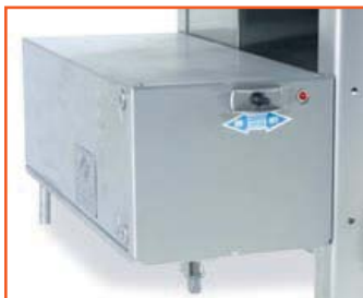
(Available with) Stainless Steel Built-on Booster.